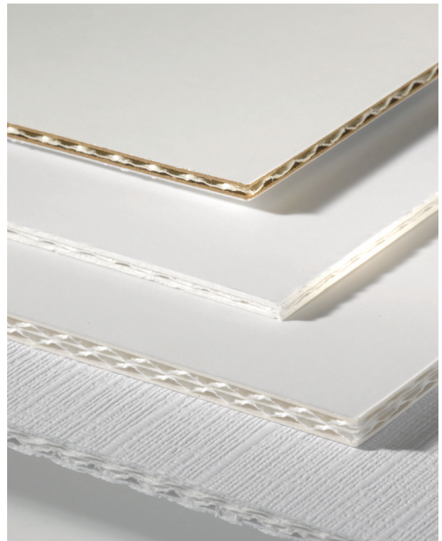
DISPA®outdoor | DISPA® 2.4 mm | DISPA® 3.8 mm | DISPA®canvas